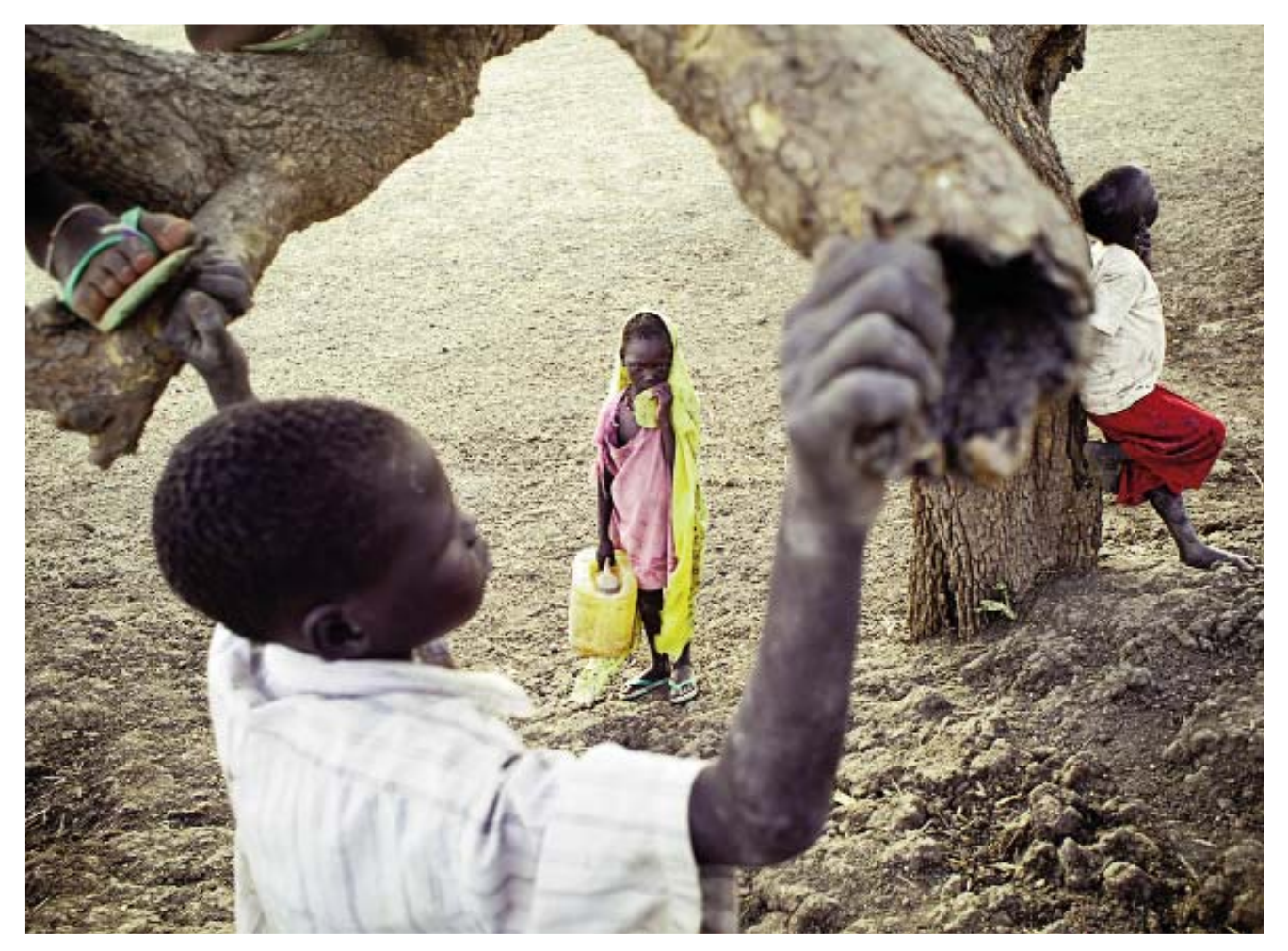
(Above) Children gather to fetch water from a pool in Jamam camp. Access to water is a huge problem for the refugees, who have fled bombing over the border

(Right) 7 February 2012. Roughly 45,000 people, mainly of the eastern Uduk ethnic group, have taken shelter at the Doro camp in South Sudan. New refugees arrive daily from Blue Nile, fleeing attacks by the northern army and air force