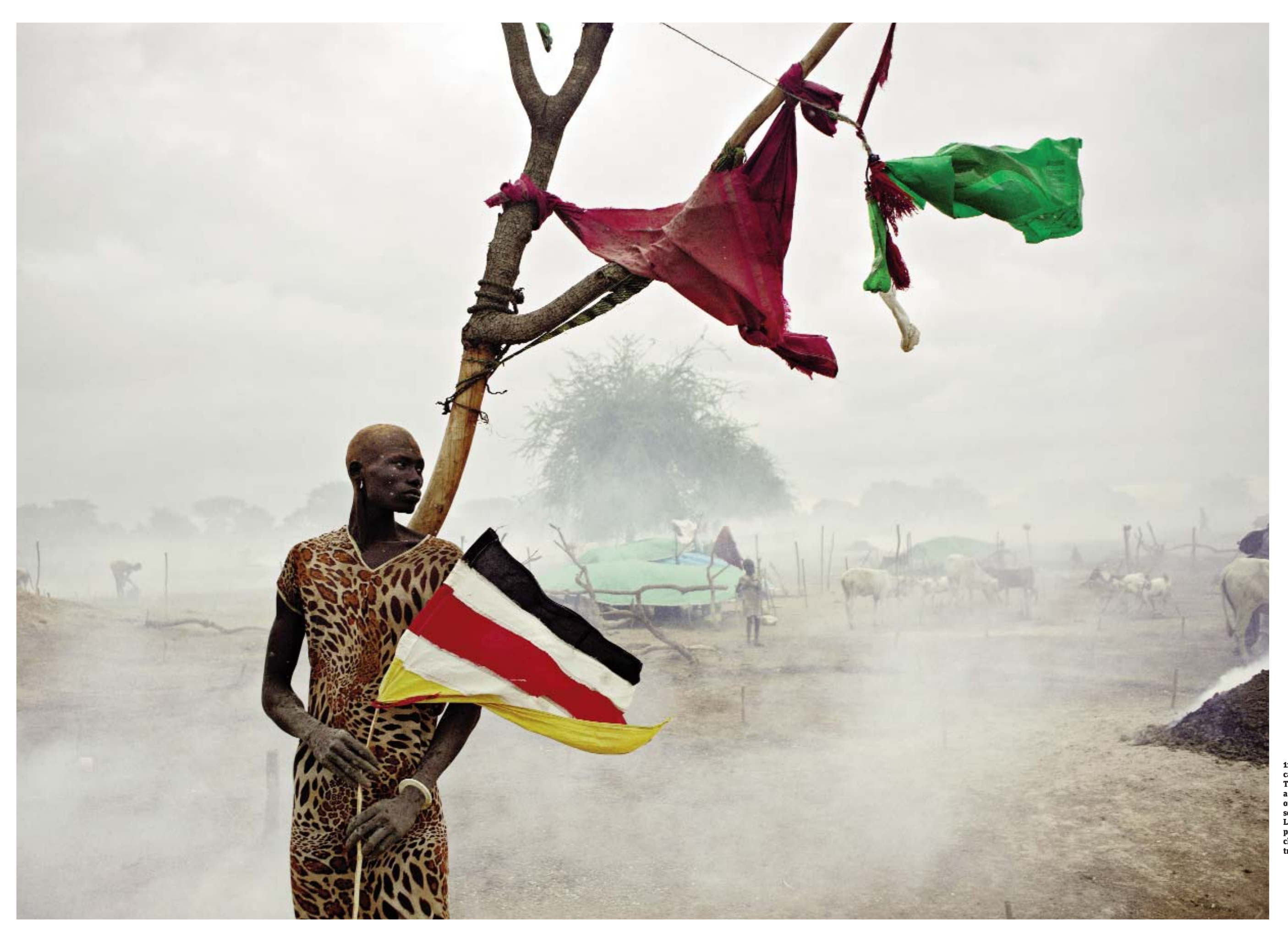
11 August 2010. A cattle camp in Lakes State. This man is carrying a home-made version of the flag of the southern Sudan People's Liberation Army. The printed pattern on his clothes mirrors a traditional animal skin