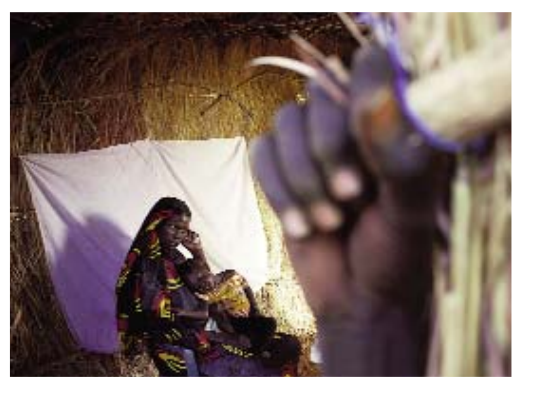
(Left) 7 February 2012. Sinas, from Soda in the northern Blue Nile State, Sudan, prepares sorghum at the Doro camp in Upper Nile, South Sudan. A lack of food drives women and children to return north to harvest their fields despite the bombings

(Top) 12 February 2012. Asha, 25, arrived alone with her daughter at the southern Jamam camp. They come from the village of Kamer in Blue Nile State, just over the border