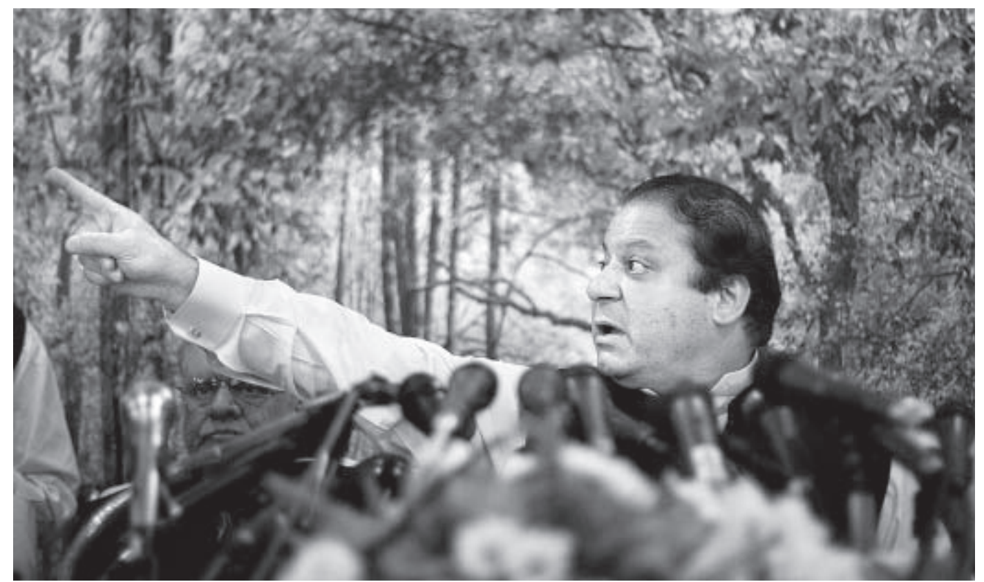
Former Pakistani prime minister Nawaz Sharif gestures during a news conference in Islamabad yesterday.