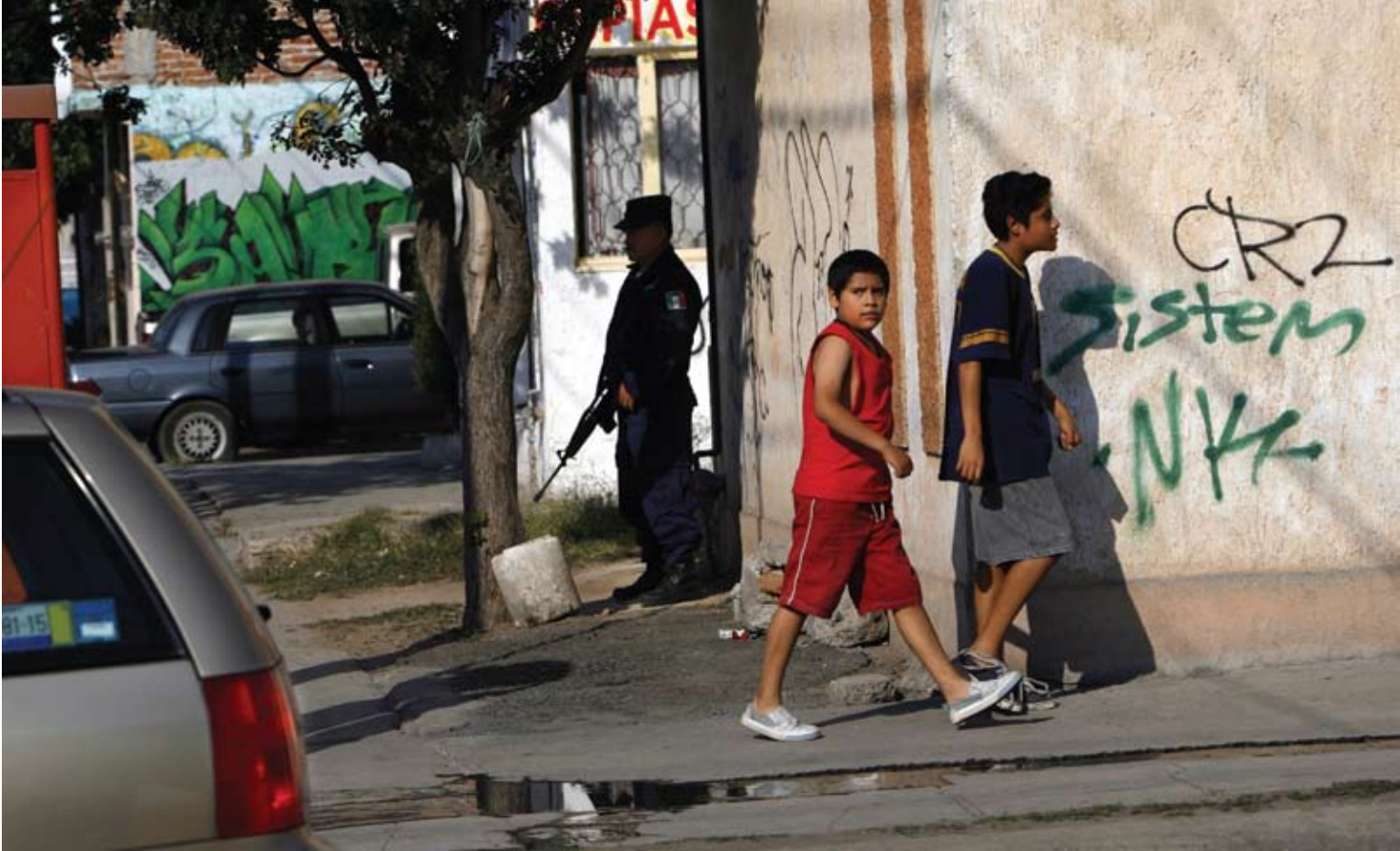
Boys walk by an armed official in Celaya in the Mexican state of Guanajuato, near the place where two grenades were hurled at a police outpost in November 2009. No one was hurt. Celaya is much more dangerous than Queretaro, which has a reputation for safety and is only 25 minutes away by car. Some say the difference is that drug cartels have agreed to keep Queretaro safe.