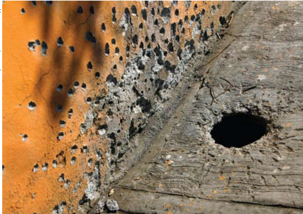
A hand grenade punched this softball-size hole in the sidewalk outside a police outpost in Celaya in the Mexican state of Guanajuato. The November 2009 attack was blamed on criminals trying to terrorize authorities in this town, just a 25-minute drive from Queretaro, a city known for a low crime rate. Mexico's drug gangs pressure authorities through a combination of violence and bribery.